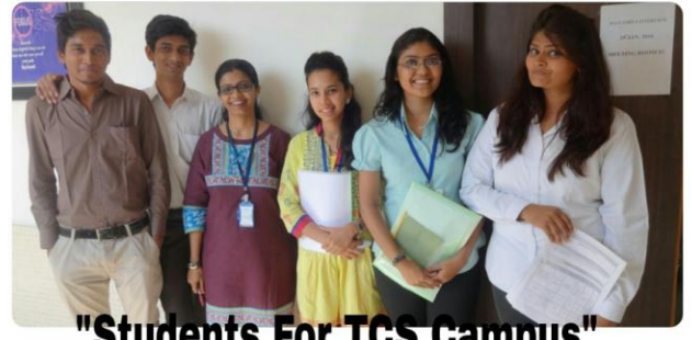
"Students For TCS Campus"