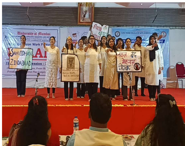
Street Play competition