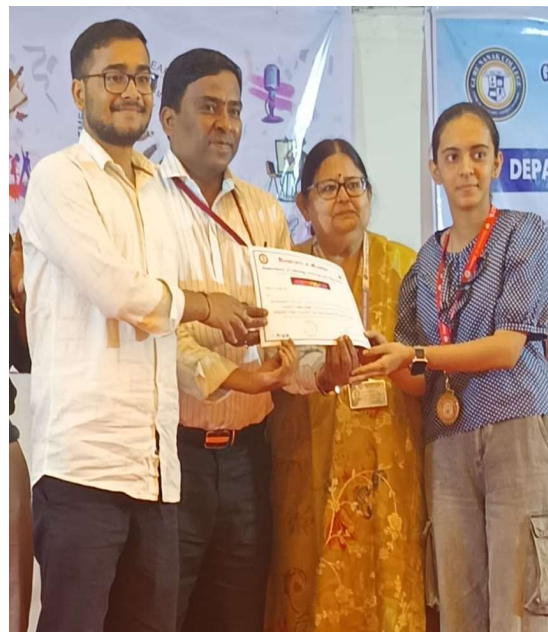
Prize distribution ceremony at the event